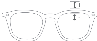
VERTICAL FITTING DISTANCE