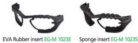
EVA Rubber insert EG-M 1023E Sponge insert EG-M 1023S