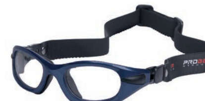
C6 Shiny Metallic Blue