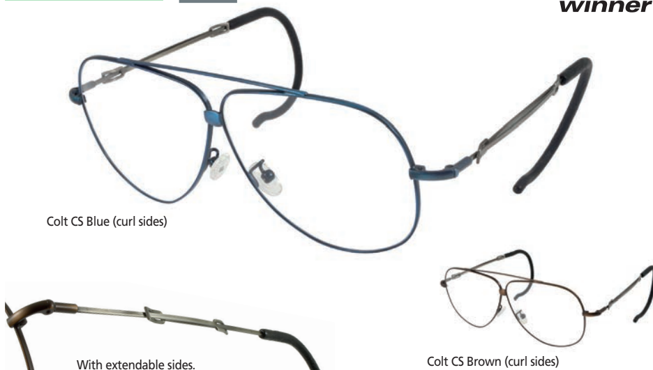
Colt CS Blue (curl sides)