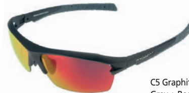
C5 Graphite Grey + Red mirror