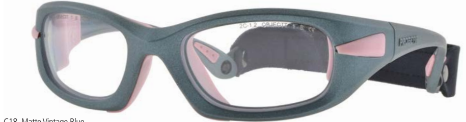
C18 Matte Vintage Blue