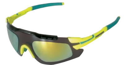
C5 Neon Yellow Matte - Brown Faceplate Gold Mirror / Brown Lens