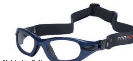
C6 Shiny Metallic Blue