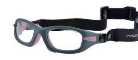
C18 Matte Vintage Blue

• RX powers outside this package range are available as per the Norville Ophthalmic Lens Catalogue plus frame cost.