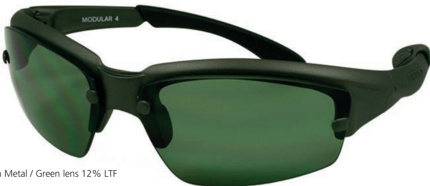
Gun Metal / Green lens 12% LTF