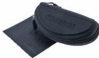
Progear Case & Cloth supplied as standard