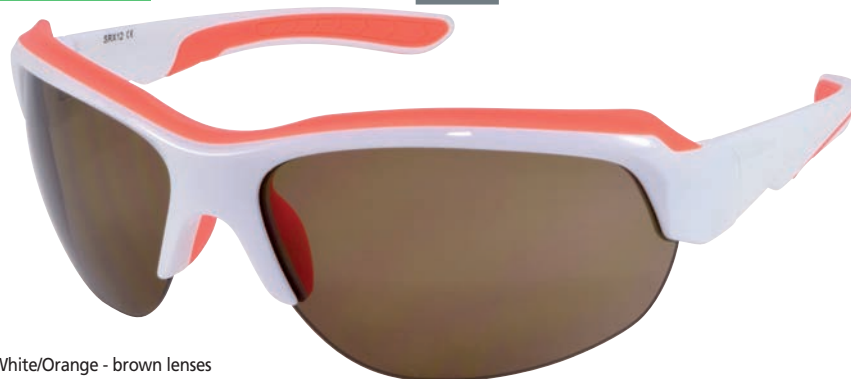
Shiny White/Orange - brown lenses