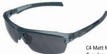
C4 Matt Midnight Grey Grey lens