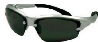
Silver / Grey lens 12% LTF

• RX powers outside this package range are available as per the Norville Ophthalmic Lens Catalogue plus frame cost.