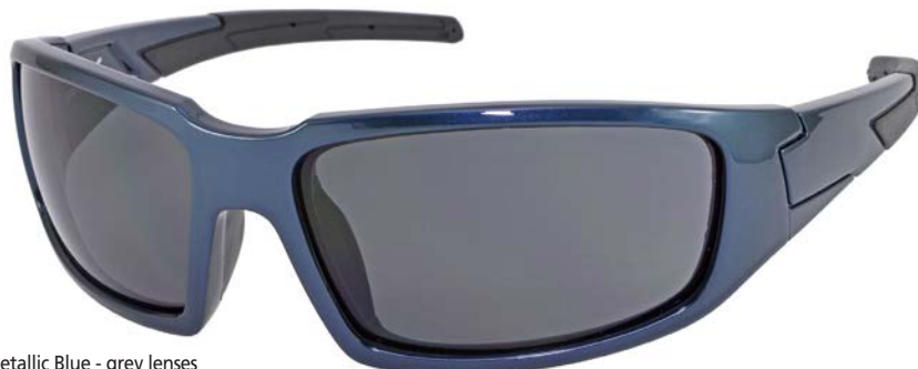
Shiny Metallic Blue - grey lenses