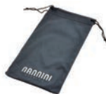
Microfibre drawstring bag supplied