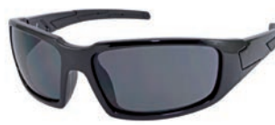
Shiny Metallic Black - grey lenses