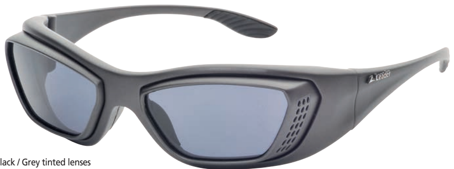
Black / Grey tinted lenses