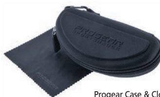
Progear Case & Cloth supplied as standard