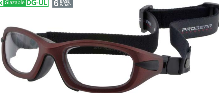
C19 Matte Burgundy