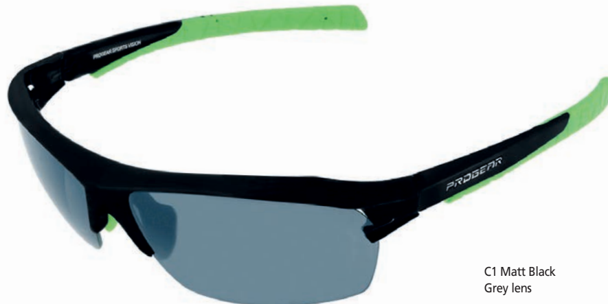
C1 Matt Black Grey lens