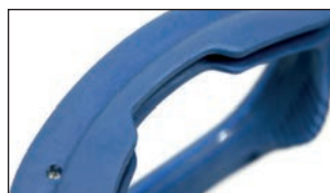
Air ventilation on top & bottom of eye rims