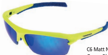
C6 Matt Neon Yellow Grey + Blue mirror