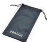
Microfibre drawstring bag supplied