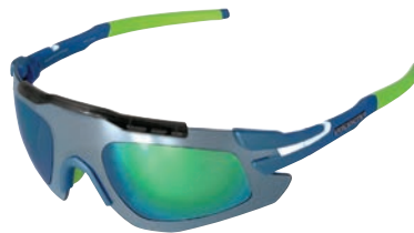
C4 Dark Blue Matte - Silver Mirror Grey Faceplate Green Mirror / Grey Lens