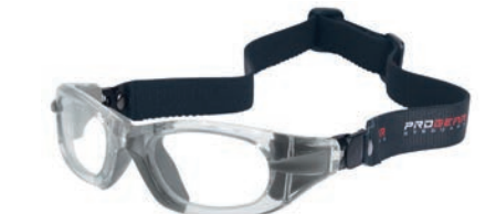
C10 Crystal Transparent