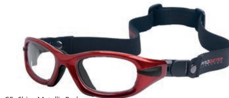
C5 Shiny Metallic Red