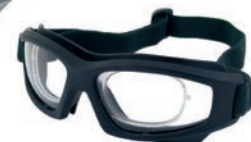
Black / Polycarbonate lens