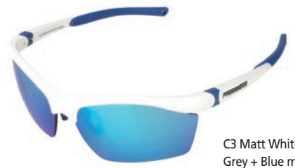
C3 Matt White Grey + Blue mirror