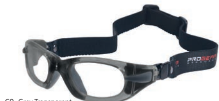
C9 Grey Transparent