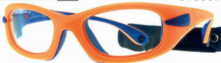
C14 Neon Orange