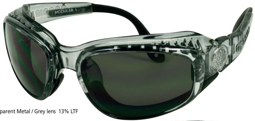
Transparent Metal / Grey lens 13% LTF