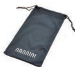
Microfibre drawstring bag supplied