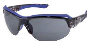
Shiny Black Marble/Blue - grey lenses