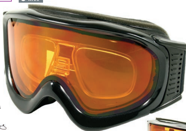
Black / Amber lens