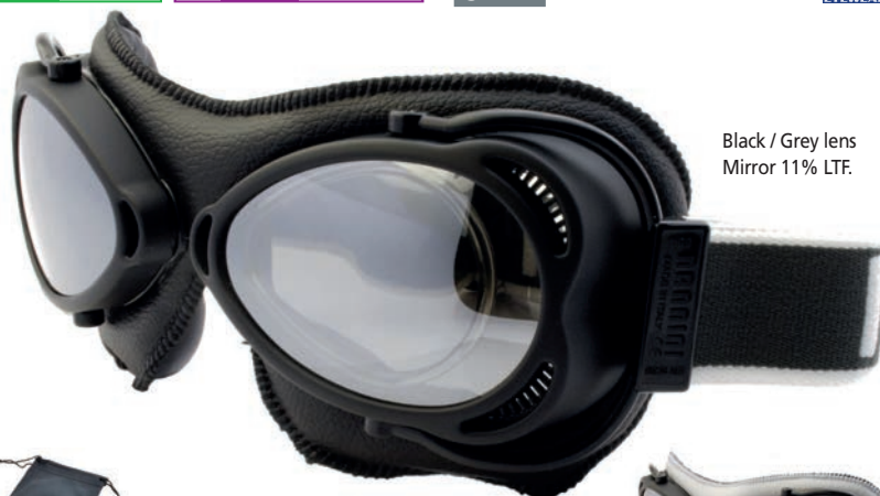
Black / Grey lens Mirror 11% LTF.