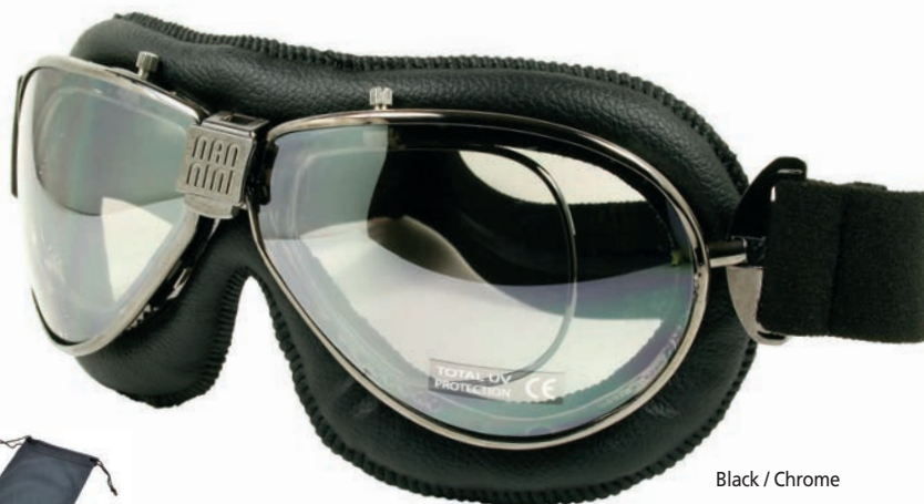
Black / Chrome