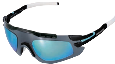
C1 Black Matte - Grey Faceplate Blue Mirror / Grey Lens