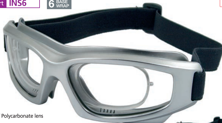
Silver / Polycarbonate lens