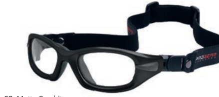
C8 Matte Graphite