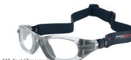
C10 Crystal Transparent