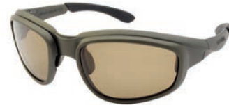
Grey / Brown polarised lens 13% LTF

Rx Glazable DG3 Rx Insert INS-UL 6 BASE WRAP