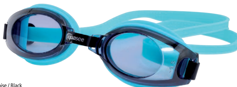
Turquoise / Black