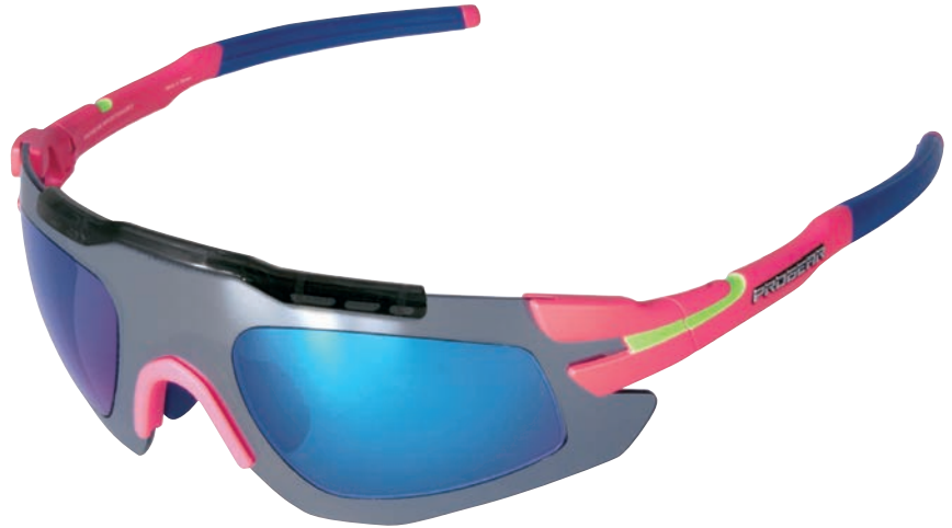
C3 Magenta Matte - Silver Grey Faceplate Blue Mirror / Grey Lens