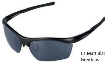
C1 Matt Black Grey lens