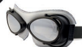
Grey / Grey lens Mirror 11% LTF.

• RX powers outside this package range are available as per the Norville Ophthalmic Lens Catalogue plus frame cost.