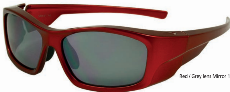
Red / Grey lens Mirror 15% LTF