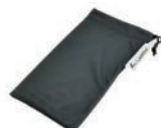
Microfibre drawstring bag supplied