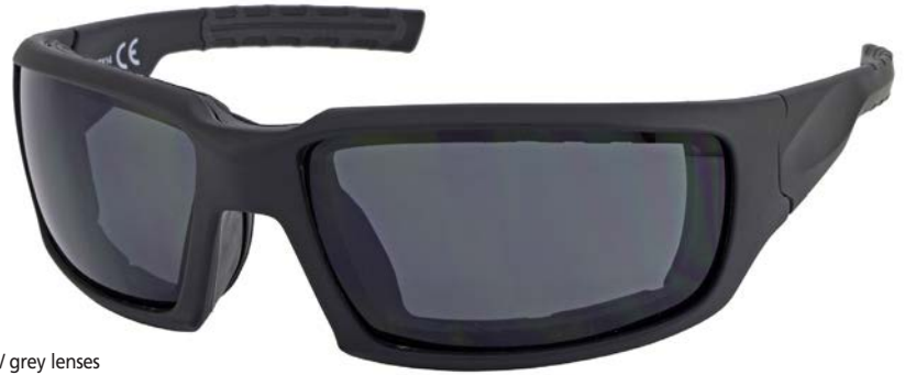
Matt Black / grey lenses