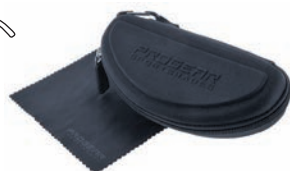
Progear Case & Cloth supplied as standard