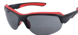
Matt Black/Red - grey lenses