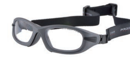
C16 Matte Grey