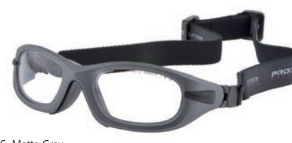
C16 Matte Grey

• RX powers outside this package range are available as per the Norville Ophthalmic Lens Catalogue plus frame cost.