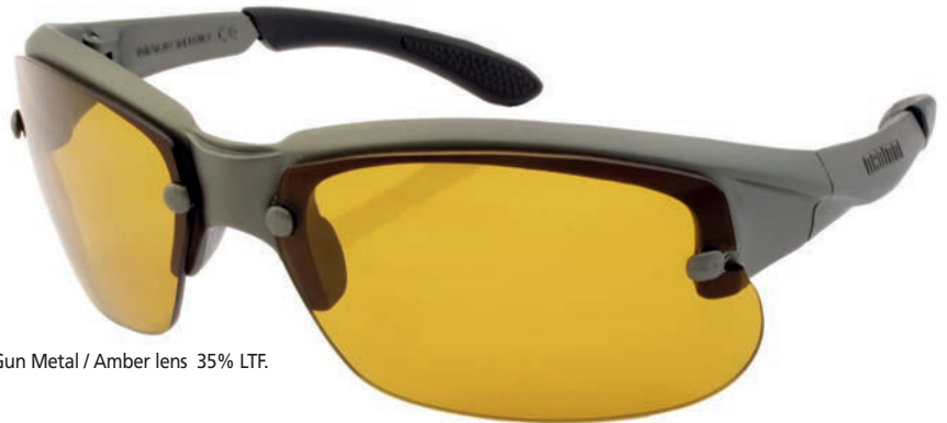
Gun Metal / Amber lens 35% LTF.