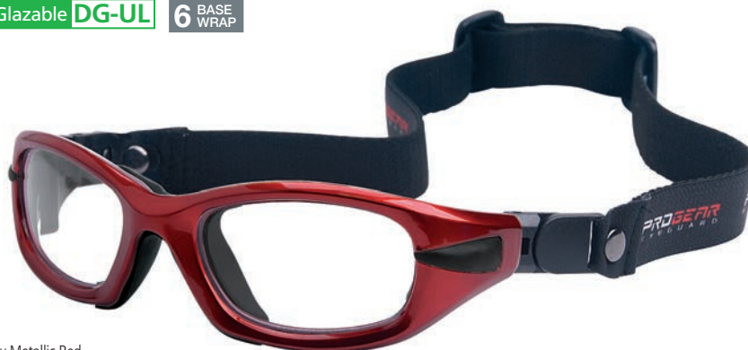
C5 Shiny Metallic Red