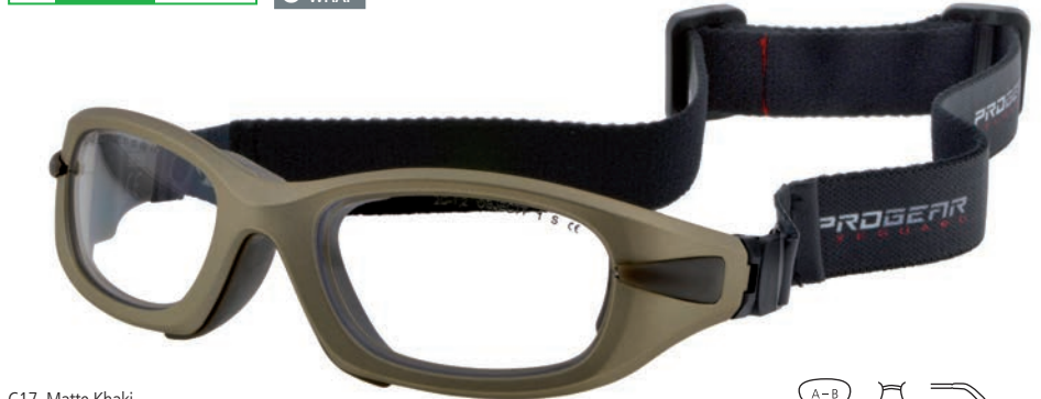
C17 Matte Khaki