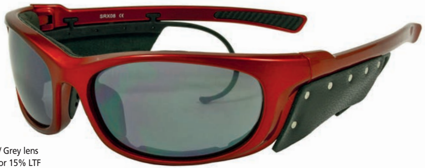
Red / Grey lens Mirror 15% LTF