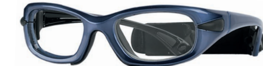
C6 Shiny Metallic Blue