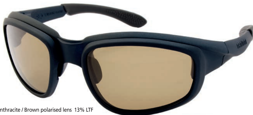
Anthracite / Brown polarised lens 13% LTF