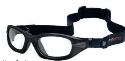
C8 Matte Graphite