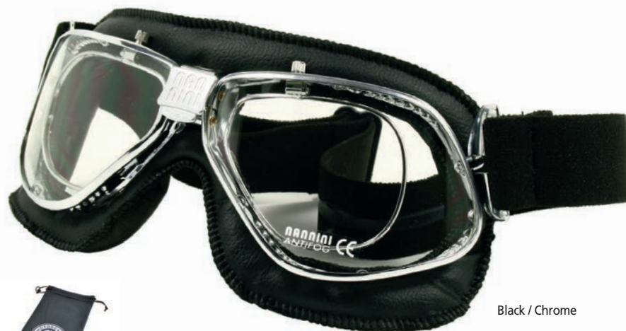
Black / Chrome