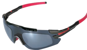
C6 Gun Matte - Grey Faceplate Silver Mirror / Grey Lens