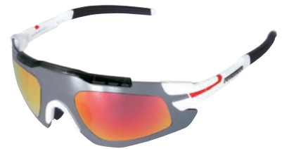
C2 White Matte - Silver Mirror Grey Faceplate Red Mirror / Grey Lens