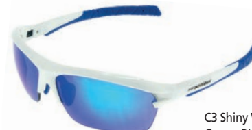
C3 Shiny White Grey + Blue mirror