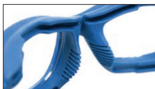
Anti-slip nose pads with sweat drainage