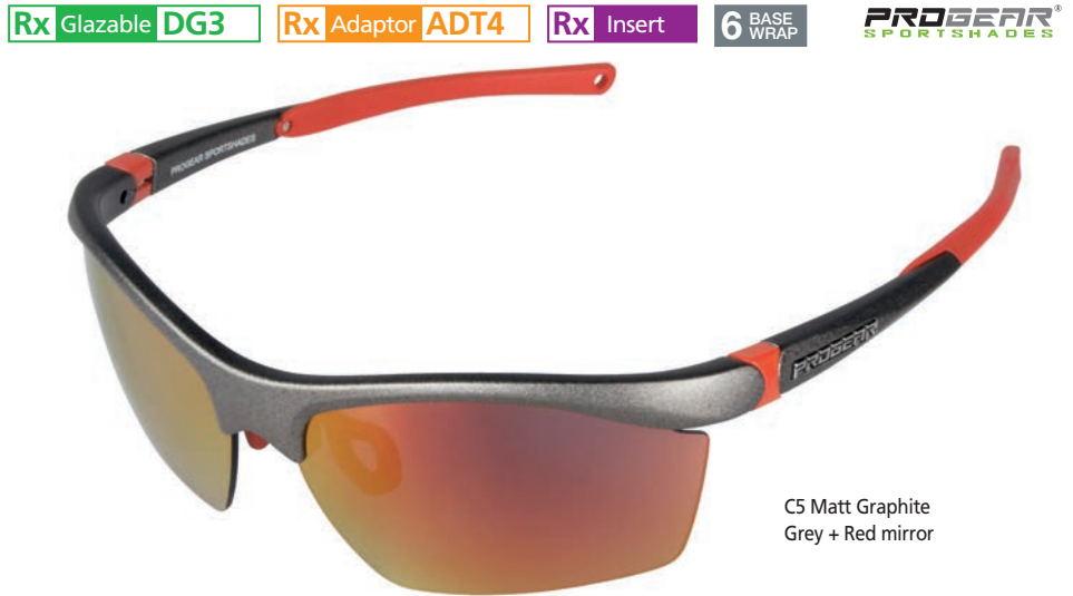
C5 Matt Graphite Grey + Red mirror