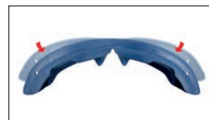
'Bendable' front for a more ergonomic fit.