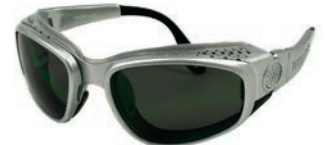
Silver / Grey lens 13% LTF