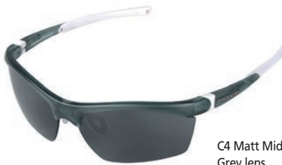
C4 Matt Midnight Grey Grey lens