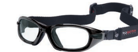
C1 Shiny Metallic Black