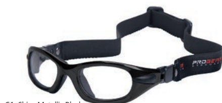
C1 Shiny Metallic Black