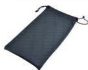
Microfibre drawstring bag supplied