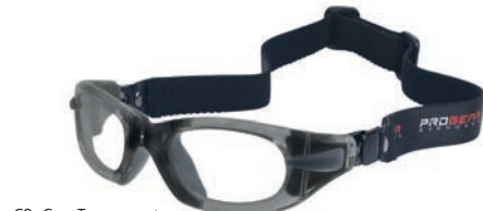
C9 Grey Transparent