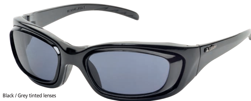
Black / Grey tinted lenses