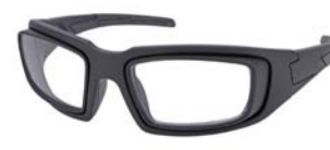
Matt Black Converted Rx eye cups, Size 50 x 30mm.

• RX powers outside this package range are available as per the Norville Ophthalmic Lens Catalogue plus frame cost.