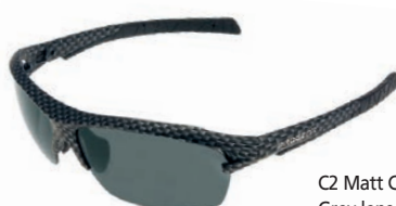
C2 Matt Carbon Grey lens