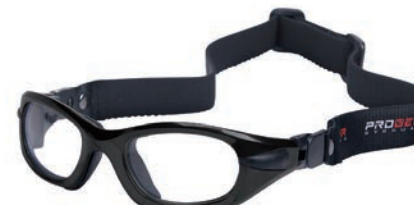
C1 Shiny Metallic Black