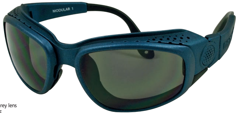
Blue / Grey lens 13% LTF.