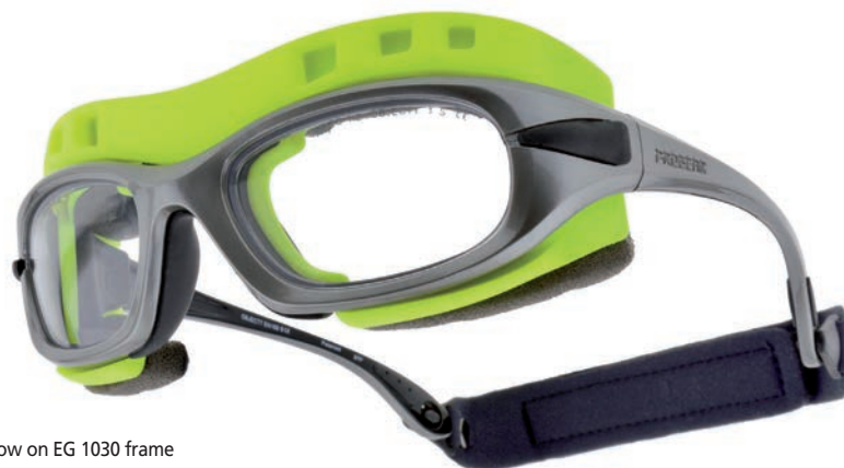
Neon Yellow on EG 1030 frame